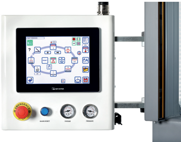
Formech Cycle View

(1) certain materials over 4mm thick may require turning the sheet mid-cycle unless twin heaters are specified (2) current may be higher depending on machine options selected